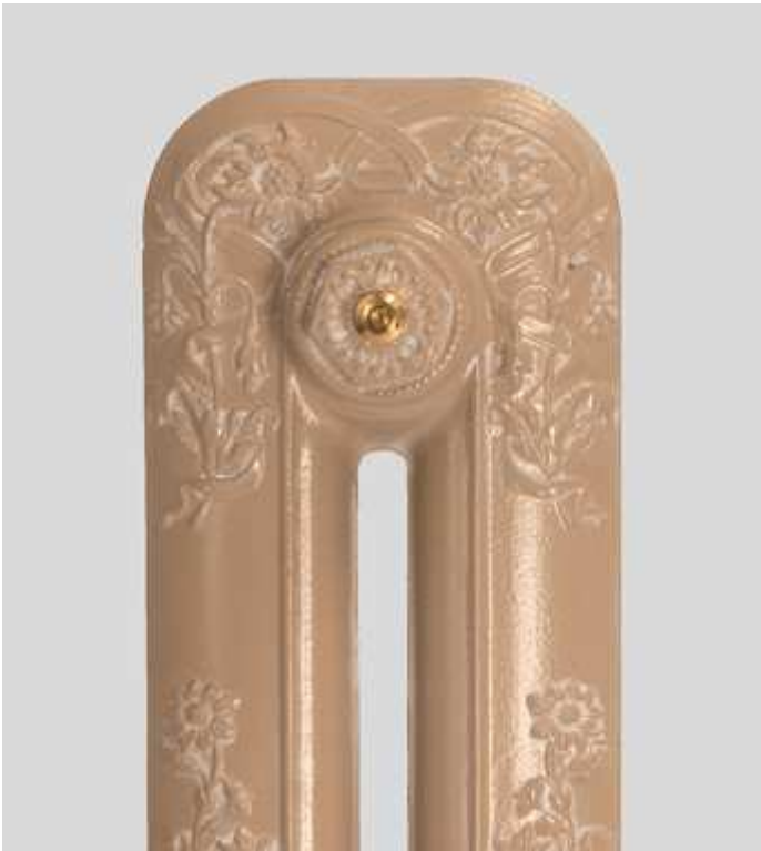
London Stone / All White