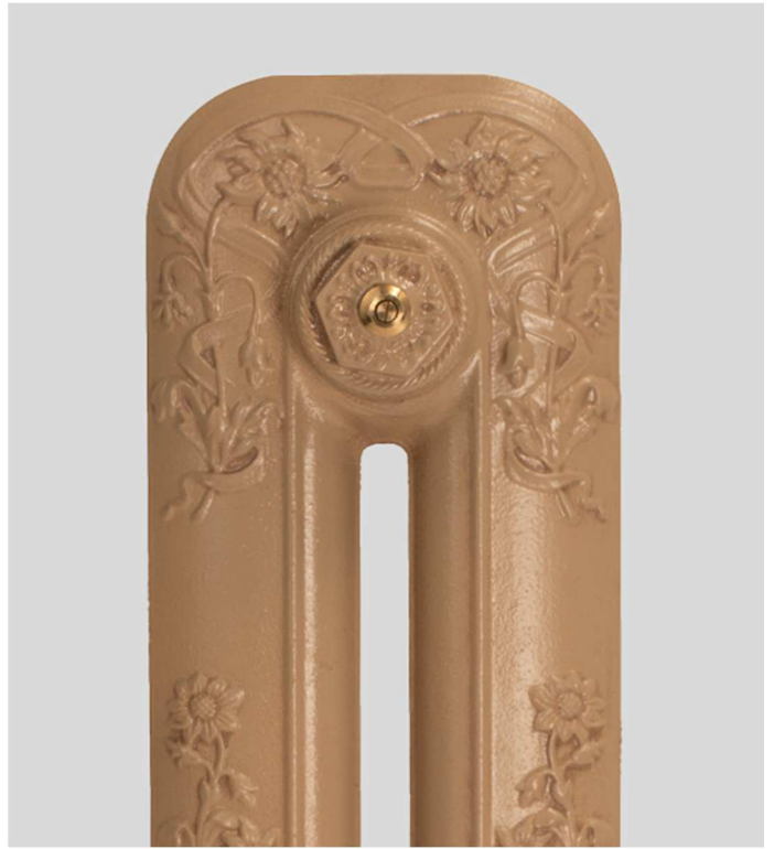
Buff / Dauphin