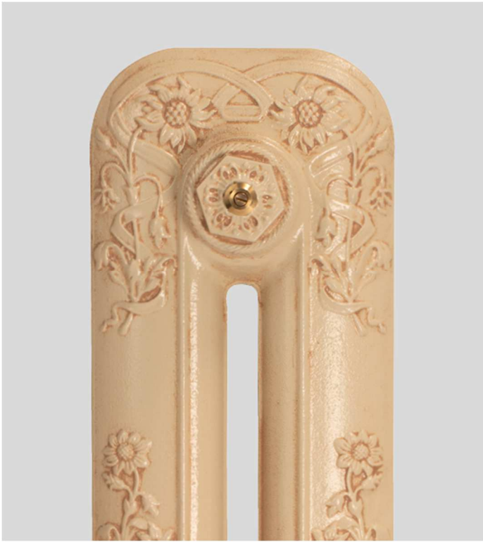
Matchstick / Buff

Twelve examples showing the beautiful effect of Antiquing on the Montpellier cast iron radiator. The choices are practically limitless!